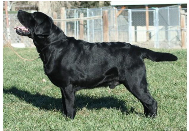
This is Fender when I first met him – 96 pounds of pure English lab!

Three sweet, calm, composed adults greeted me at the door, two females and a male. The male was huge and as black as coal. His name was Fender. He was not quite two years old and his owner had recently returned him "because he couldn't keep up with the other hunting labs."